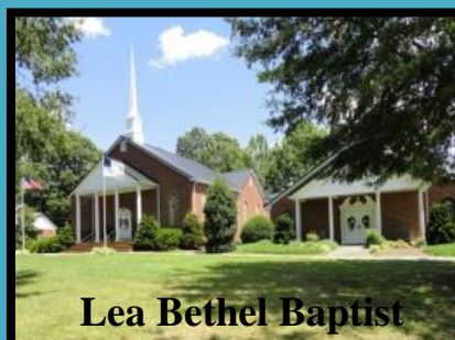
Lea Bethel Baptist