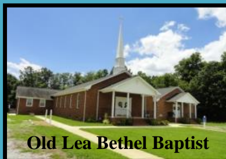
Old Lea Bethel Baptist